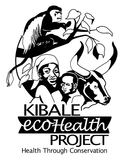
Fig. 8.2. The Kibale EcoHealth Project logo, meant to represent the ecological interdependency of human, primate, and domestic animal health.

data collected over the past approximately 15 years on primate populations inside and outside of the park. The Kibale EcoHealth Project collaborates with the Kibale Chimpanzee Project to identify risks for disease transmission between chimpanzees and people inside and outside of the park. The Kibale EcoHealth Project works extensively with local communities around Kibale – an arrangement that would not have been possible without the positive community relations that have been built over the years by efforts such as the Kasisi Project. Although the Kibale EcoHealth Project itself is relatively young, it continues in the tradition of long-term research and successful conservation that has helped make Kibale one of the premier tropical forest locations in the world for research, conservation, education, and sustainable development.