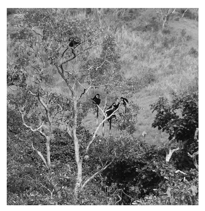
Fig. 8.1. Black-and-white colobus in Rurama forest fragment, approximately 1 km from the western edge of Kibale National Park. Primates in such locations must run a gauntlet of threats each day, from aggressive dogs to habitats scattered with pathogens.

The "Kibale EcoHealth Project" represents an attempt to bring this nascent and evolving paradigm to bear on infectious diseases shared among primates, people, and domestic animals in the region of Kibale National Park, Uganda. Founded in 2004, the project takes a "place-based," epidemiological approach to understanding the interrelation-ships among primate health, human health, and the health of domestic animals in an anthropogenically altered environment (Fig. 8.2).