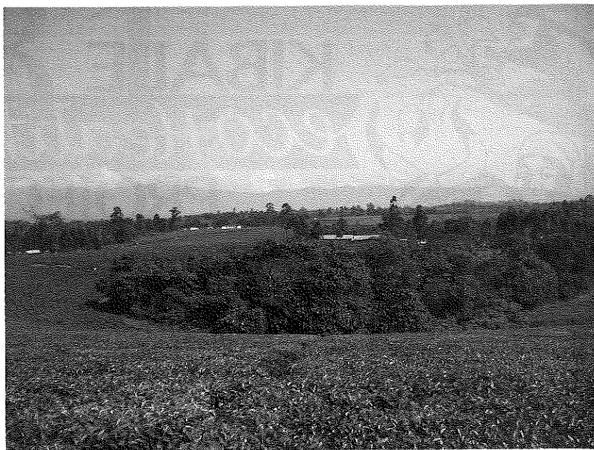
Figure 31.2: Forest fragment outside of Kibale National Park, with Rwenzori Mountains in the background. Note the abrupt boundary between the forest fragment and the surrounding tea crop.

tend to persist in areas unfavorable for agriculture, such as wet valley bottoms and steep hillsides, and they contain remnant populations of species found in the park, including primates (Onderdonk and Chapman 2000). Local people use these forest fragments for activities ranging from forest product extraction (e.g., timber, charcoal, forest plants) to slash-and-burn agriculture.