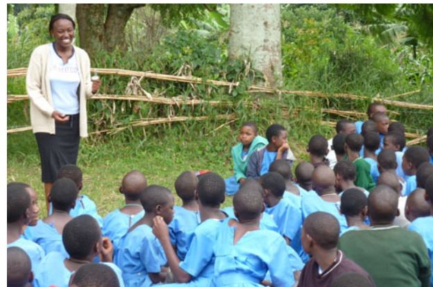
PLATE 2 The nurse from the Kibale Health and Conservation Centre giving an outreach talk at a local school.

A common criticism of conservation programmes that aid local communities and improve economic welfare is that they promote immigration and increase population growth near the protected area. For example, Struhsaker et al. (2005) estimated that 47% of tropical protected areas in Africa had