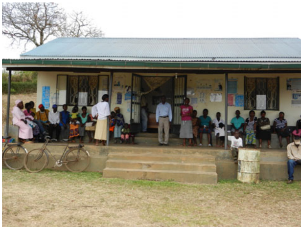
PLATE 1 Kibale Health and Conservation Centre, adjacent to Kibale National Park, Uganda (Fig. 1).

*Including, but not limited to, open cuts, burns, boils, abscesses, pyomyositis, and mast infections.